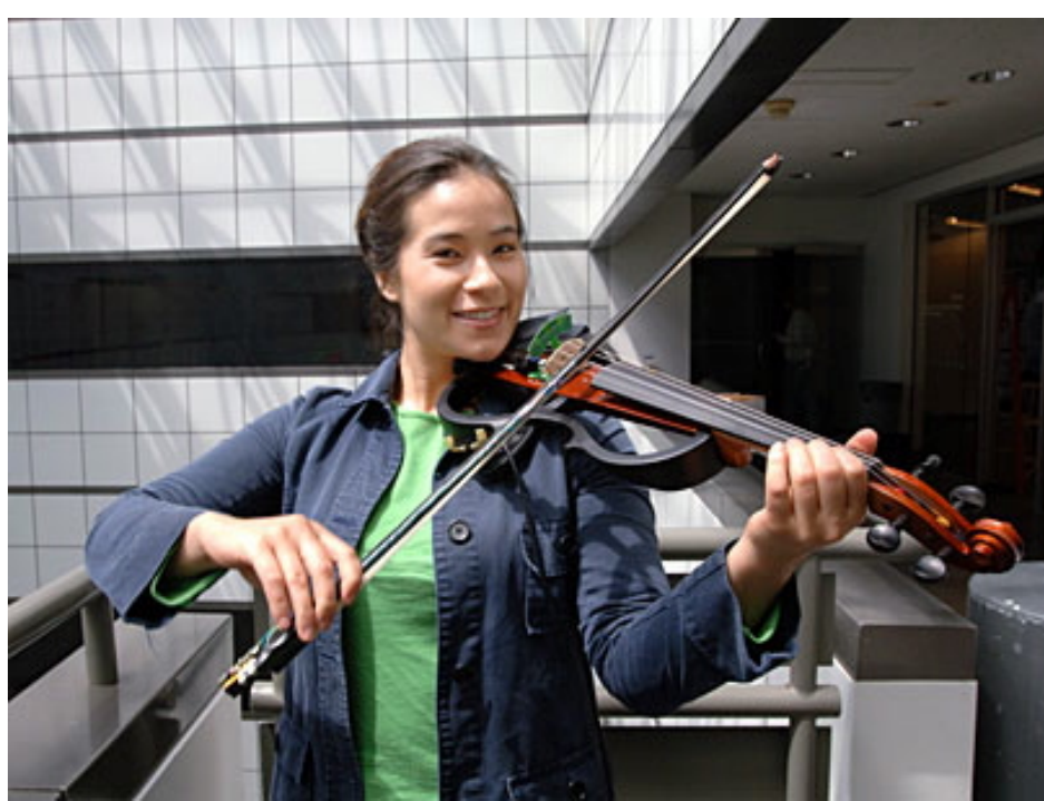
TeknoDida 23 Sep 2011